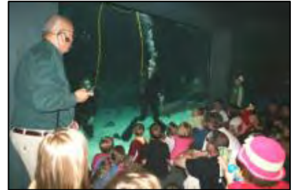
South Pacific Aquarium Interactive Dive