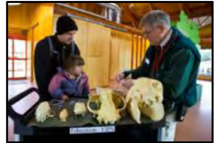
A young guest learns about Asia animals from an education volunteer.