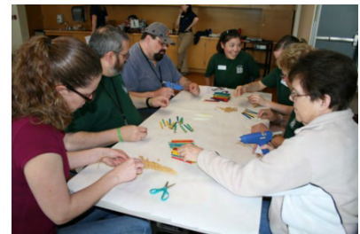
Volunteers making budgie seed sticks