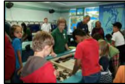
Guests get a chance to touch marine animals in the touch tank.