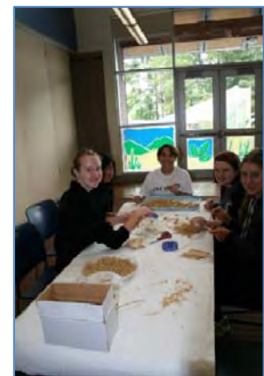
Community Group making budgie seed sticks