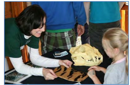
A young guest learns about Asia animals from an education volunteer.