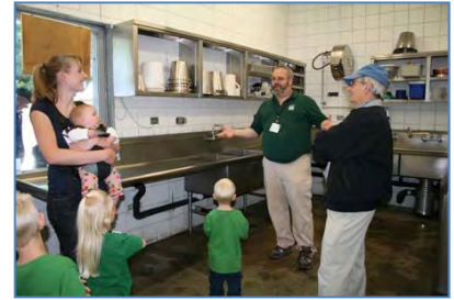
Guests get a chance to see behind the scenes at marine mammal food prep